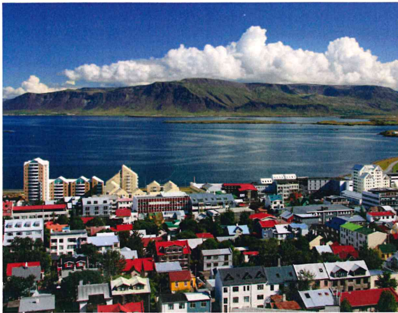
Reykjavik, Iceland's capital city