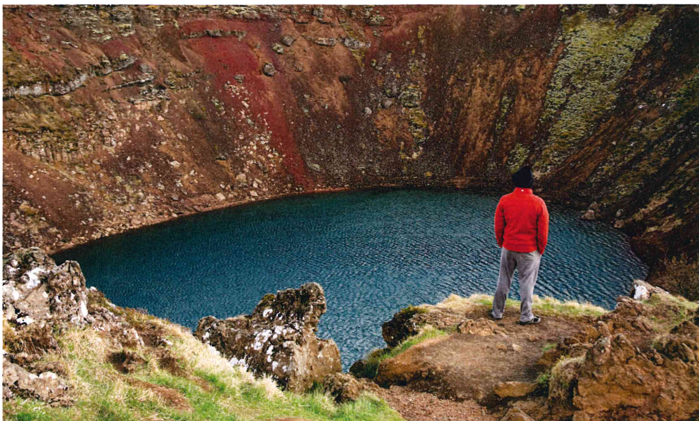
A crater formed by volcanic action in Kerid