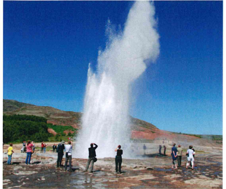
A geyser erupts for camera-wielding travelers

Your exploration continues to Dyrholaey, a magnificent rocky headland with sheer cliffs, enroute to the beautiful village of Vik. In the sea, just outside of Vik, you'll see the Reynisdrangar Rocks. According to legend, the Reynisdrangar were formed when two trolls were trying to drag a three-masted ship to land. When daylight broke, the trolls were turned to stone.