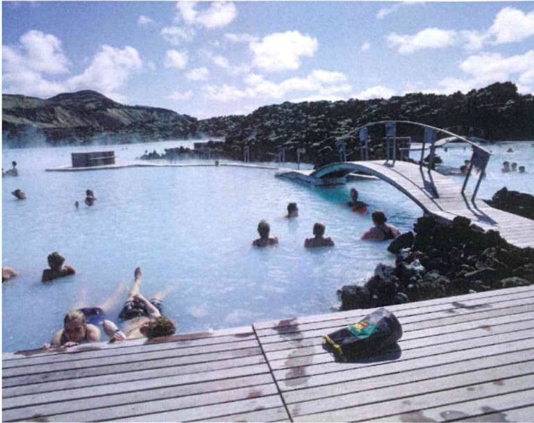
Swim in the Blue Lagoon, warmed by forces of nature